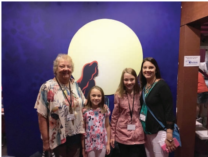
A Platinum Adventures member and her family enjoying "The Little Mermaid" at the Fireside Theatre this summer.

Price includes: Lunch, presentation, and gratuities.