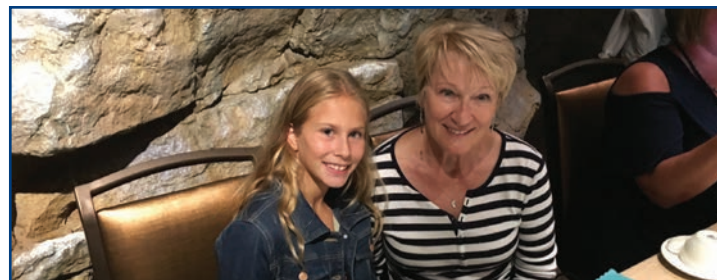
A Platinum Adventures Club member and her granddaughter enjoying "The Little Mermaid" at The Fireside Theatre this summer.